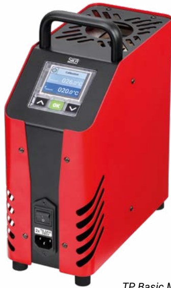
TP Basic Marine