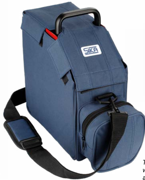
TP Basic Marine set with calibration inserts and transport bag